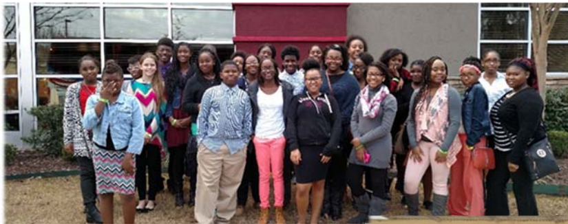
Seventh and eighth grade Talent Search participants from Admiral Moorer Middle School enjoyed lunch at Red Robin Restaurant after seeing a performance of Ain't Misbehavin' at the Alabama Shakespeare Festival.