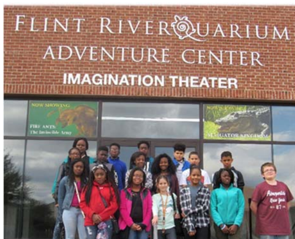
Talent Search participants from Abbeville Elementary School's sixth grade stop for a picture outside Imagination Theater at Flint RiverQuarium.

Sixth-graders from Abbeville Elementary School visited the Flint RiverQuarium in Albany, Georgia to participate in a lab class, complete a scavenger hunt, and view a related movie in the Imagination Theater.