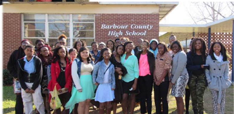
At right, Talent Search participants return to Barbour County High School following a visit to the Alabama Shakespeare Festival.

TRiO Educational Talent Search (ETS) at Wallace Community College has recently been busy with cultural and educational enrichment activities. Two groups of seventh and eighth grade participants had the opportunity to see Broadway performers bring to life music from the 1920's and 1930's in a theatrical production of Ain't Misbehavin' at the Alabama Shakespeare Festival in Montgomery, Alabama.